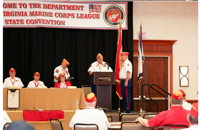
Department of WV 2019 Convention, Morgantown, WV - Hosted by Det 342