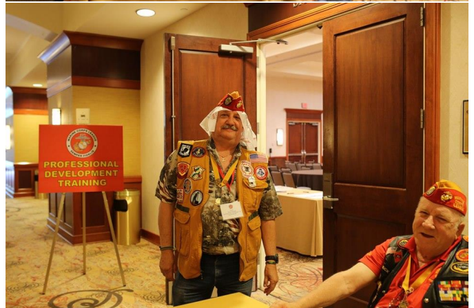
Department of WV 2019 Convention, Morgantown, WV - Hosted by Det 342