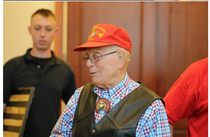
Department of WV 2019 Convention, Morgantown, WV - Hosted by Det 342