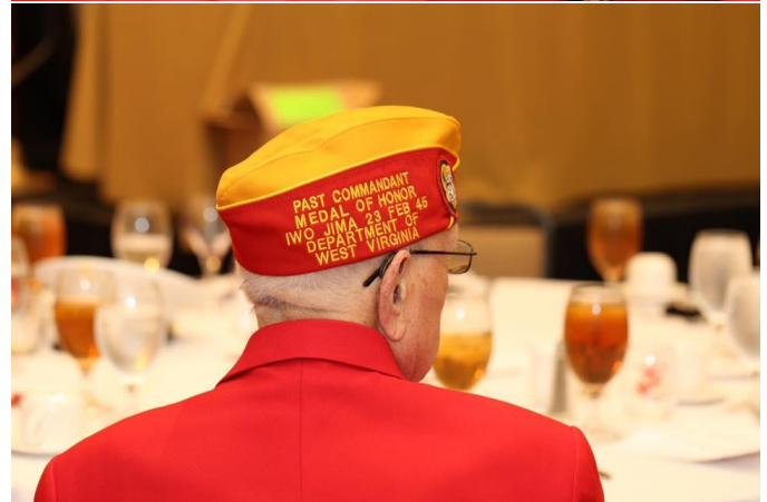
Our own Medal of Honor Recipient from Iwo Jima, WWII Hershel "Woody" Williams